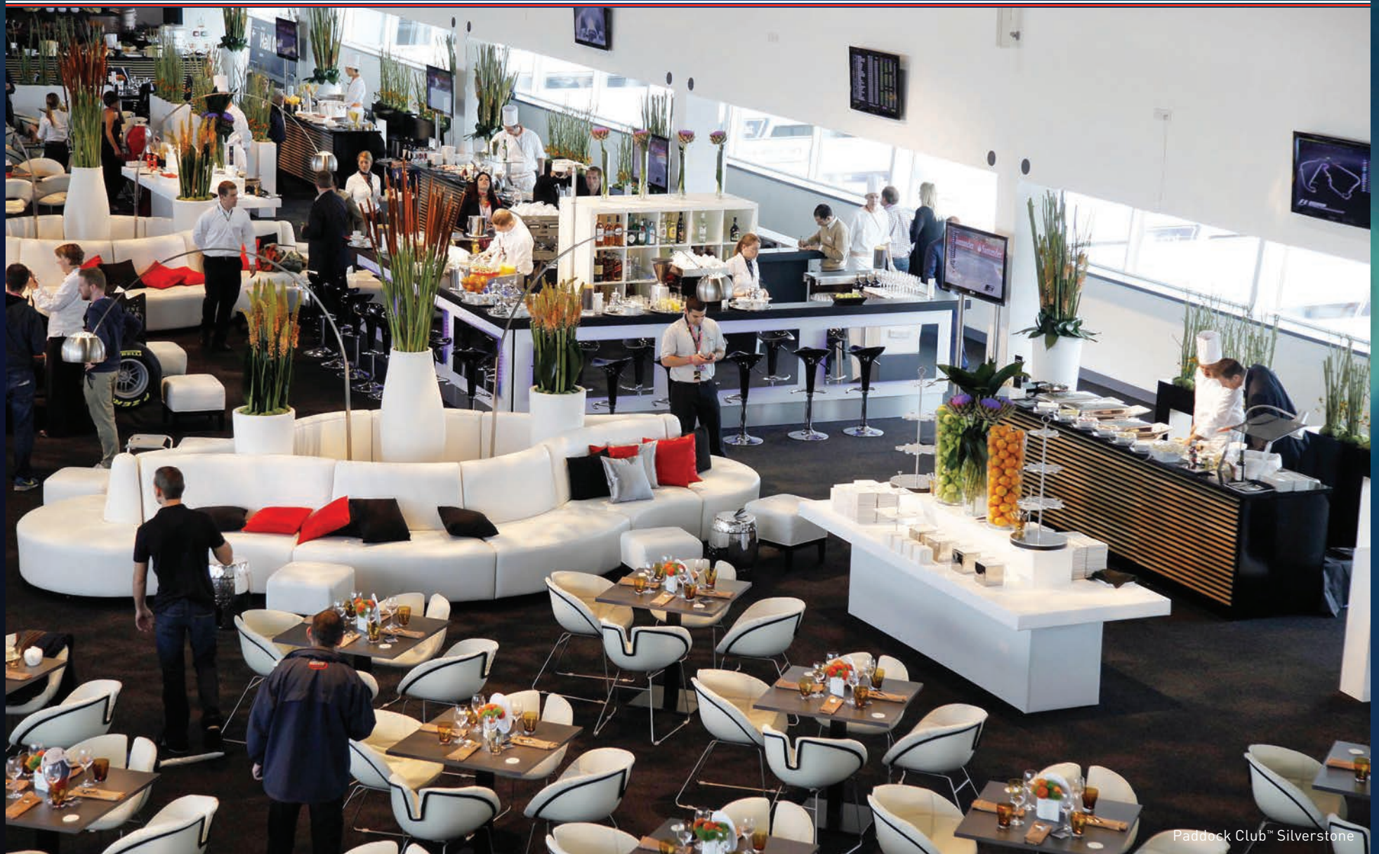
Paddock Club™ Silverstone