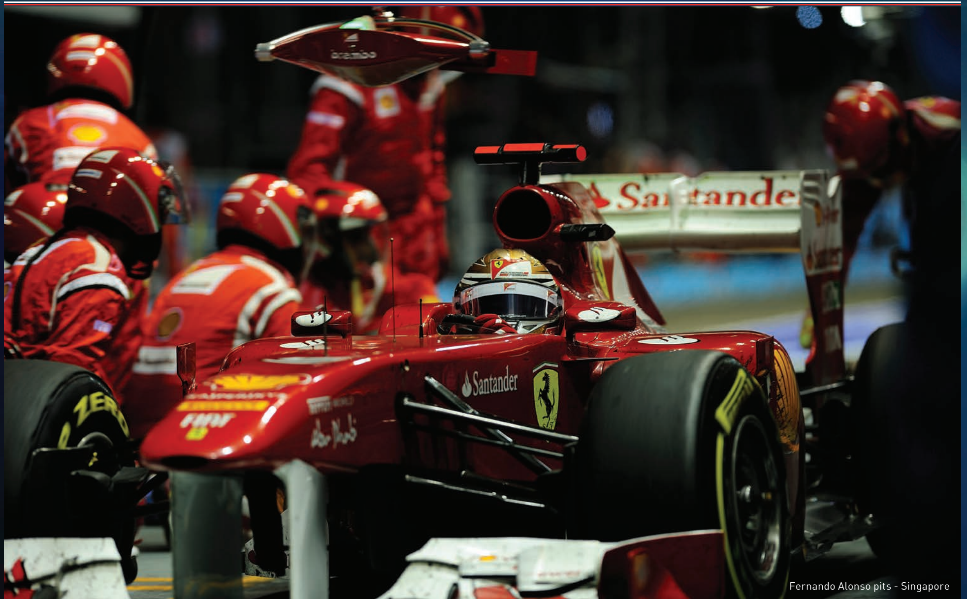
Fernando Alonso pits - Singapore