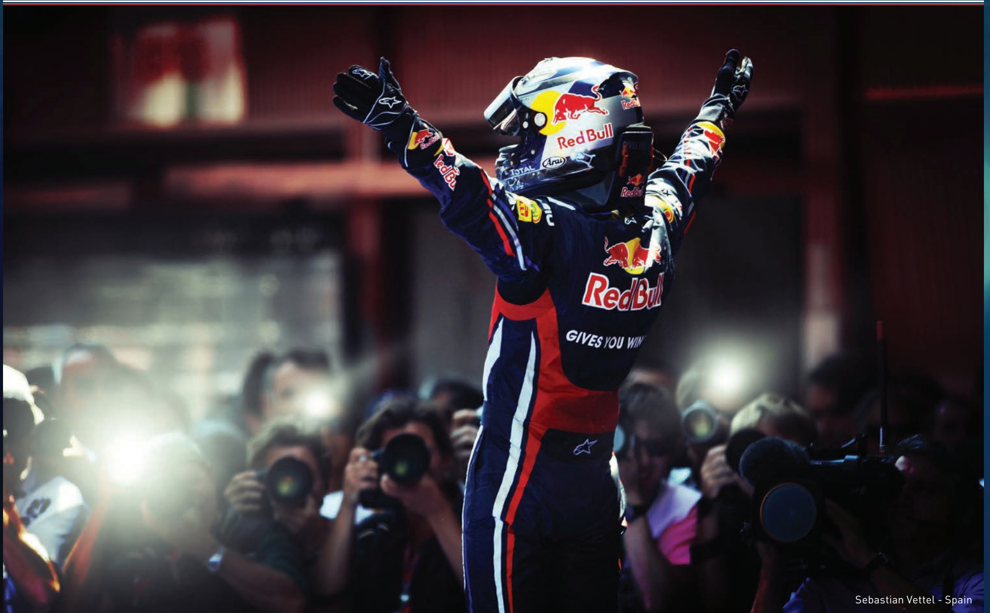
Sebastian Vettel - Spain